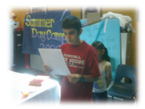
1st Reading from Exodus